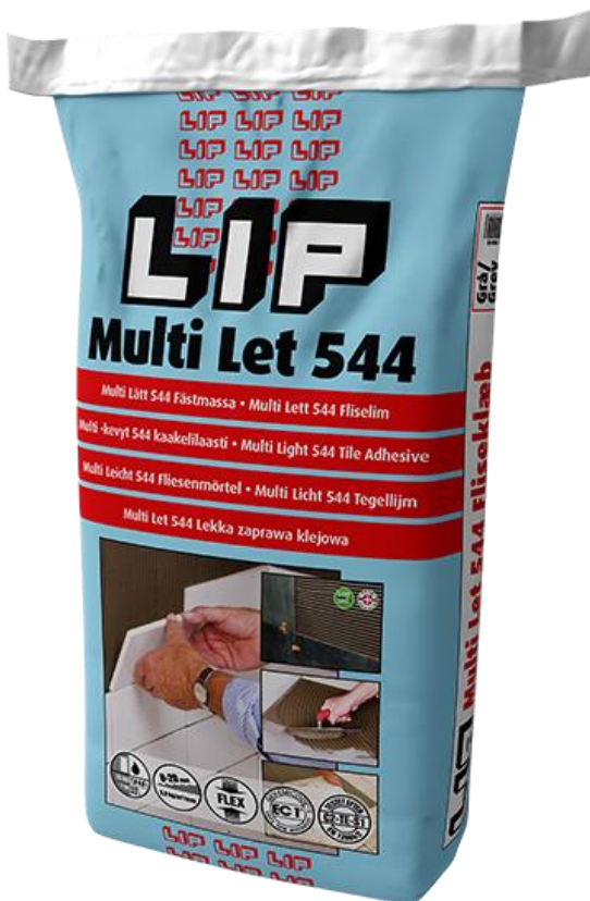
Figure 1: Pictures of the LIP product covered in this project report.