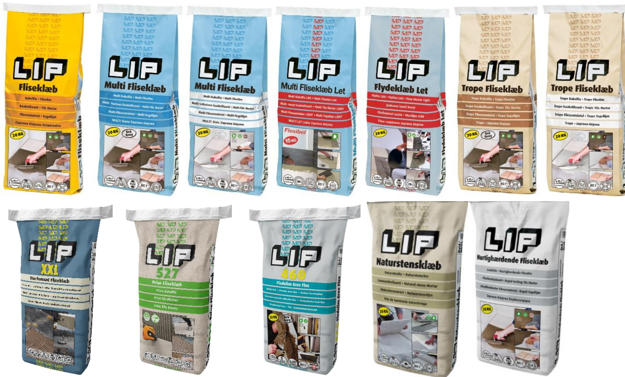
Figure 1: Pictures of the LIP products covered in this project report.

LIP Tile Mortar, LIP Multi Tile Mortar – Grey and White, LIP Multi Tile Mortar Light, LIP Flow Mortar Light, LIP Tropic Tile Mortar – Grey and White, LIP Tile Mortar XXL, LIP 527 Tile Mortar, LIP 460 Sheet adhesive coarse flex, LIP Natural Stone Grout and LIP Rapid-Setting Tile Adhesive.